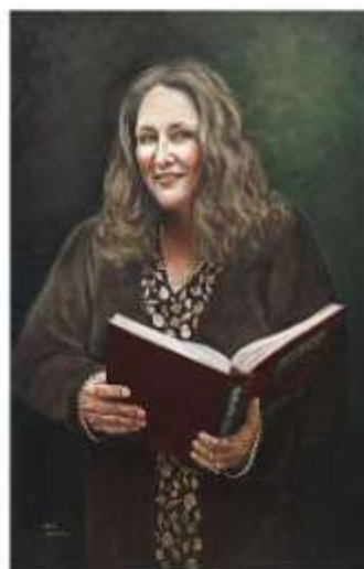
"Telling" "Blue Marble"